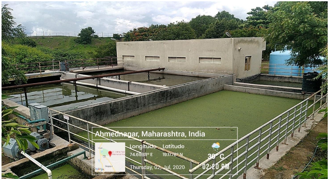
Sewage Treatment Plant (Capacity of 1000 M3/ Day)