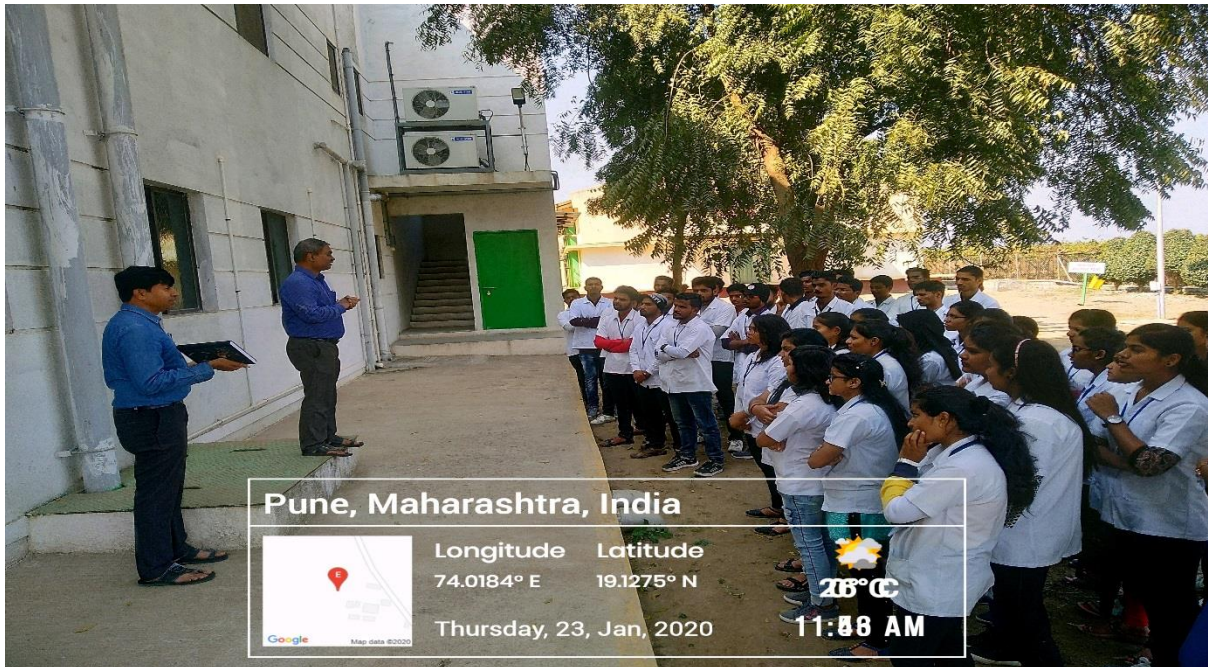
Industrial Visti to Premium Serums & Vaccines Pvt. Ltd: 23 January 2020