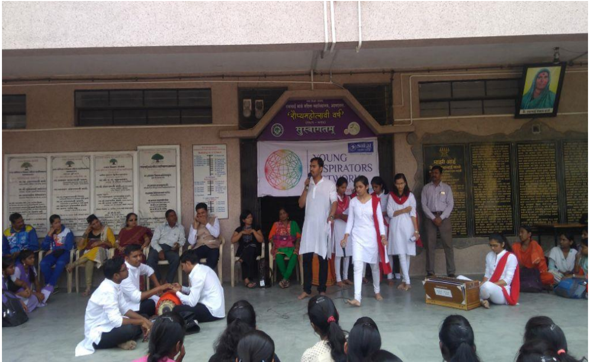
WORLD WOMAN'S DAY : POWADA CULTURAL ACTIVITY AT RADHABAI KALE MAHILA MAHAVIDYALAYA : 08/03/2018