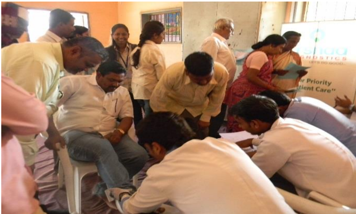
Medical Camp on CBC Estimation & Osteoporosis Estimation: 08/01/2018