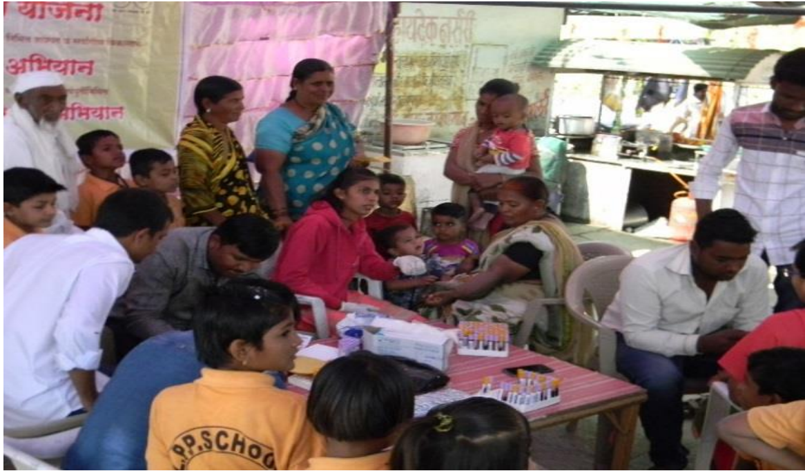
Medical Camp on CBC & Thyroid Estimation of Villagers & ZP School Students: 09/01/2019