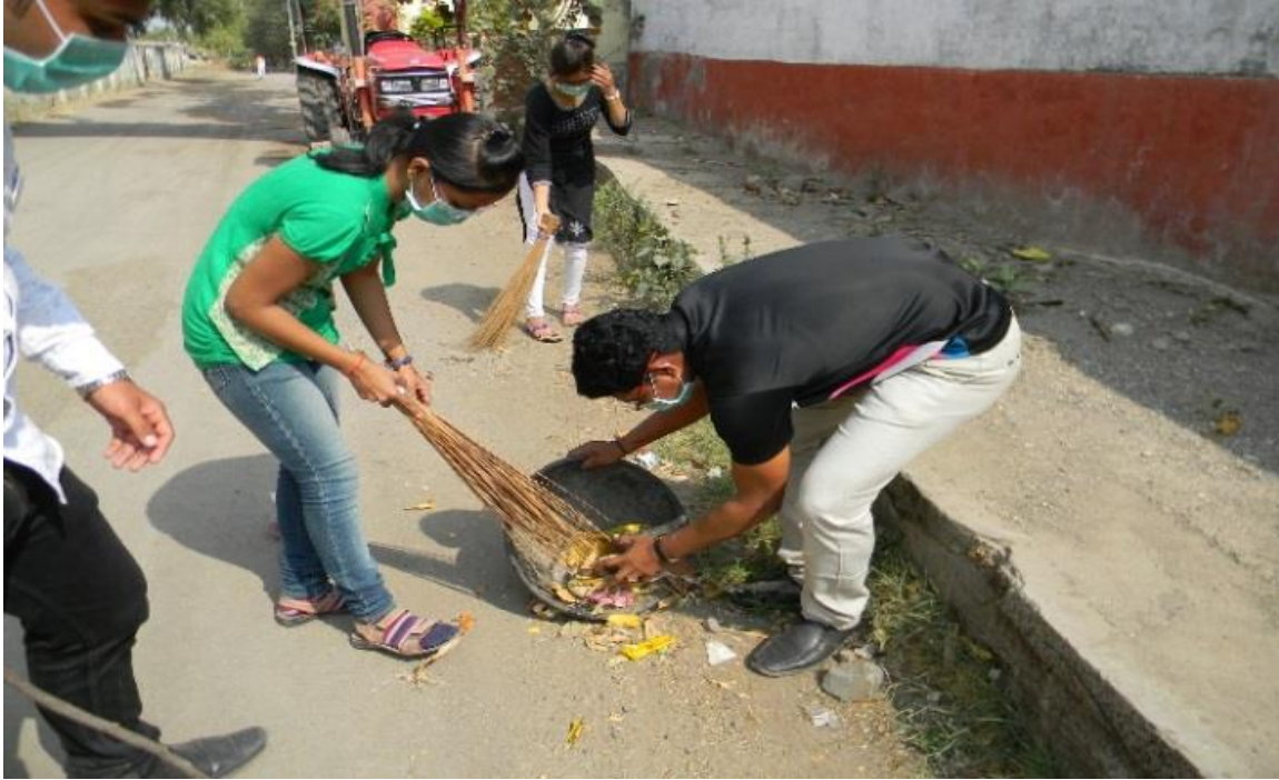
Gram Swachhata Abhiyan : 18/01/2017