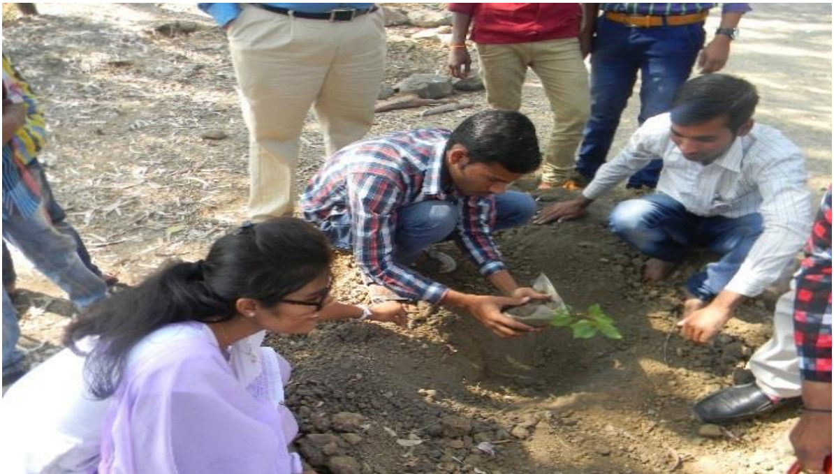
Tree Plantation Activity : 11/01/2019