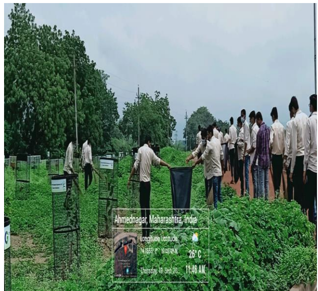
Jalsaksharat Abhiyan & Plastic Mukt Bharat Abhiyan at Ahmednagar Fort : 19/09/2019