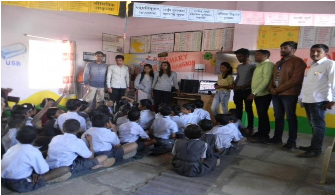
Computer Teaching To ZP School Students: 16/01/2017