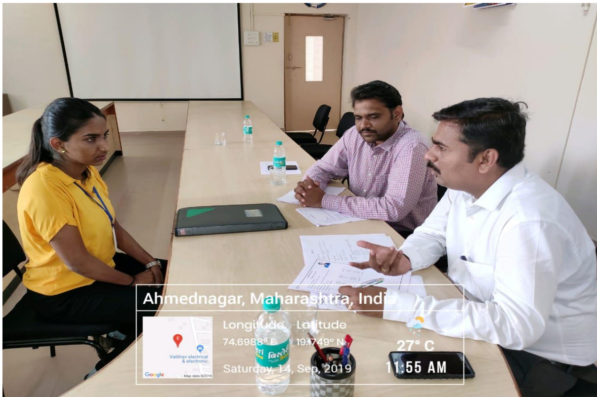
Campus Placement Drive by Qwist Pvt. Ltd, Pune on 14/09/2019