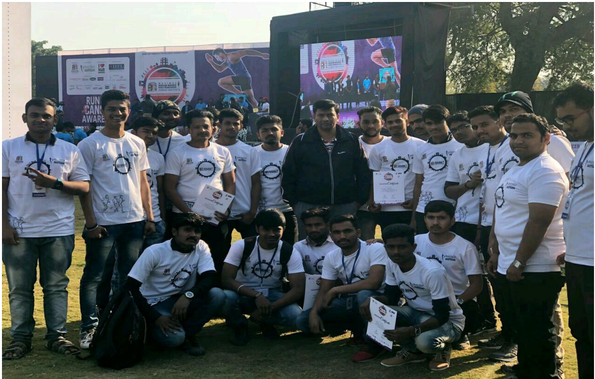
WORLD CANCER DAY : NAGAR RISING HALF MARATHON : 04/02/2018