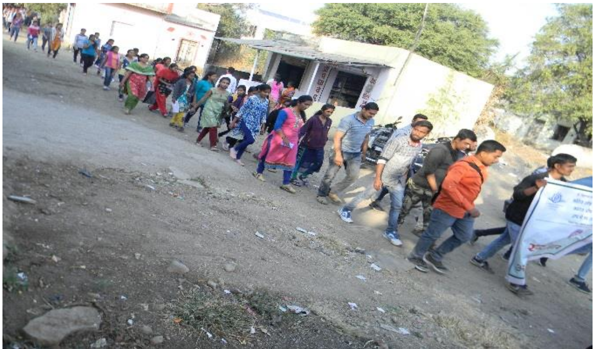
Rally on Beti Bachao Beti Padhao Abhiyan: 12/01/2019