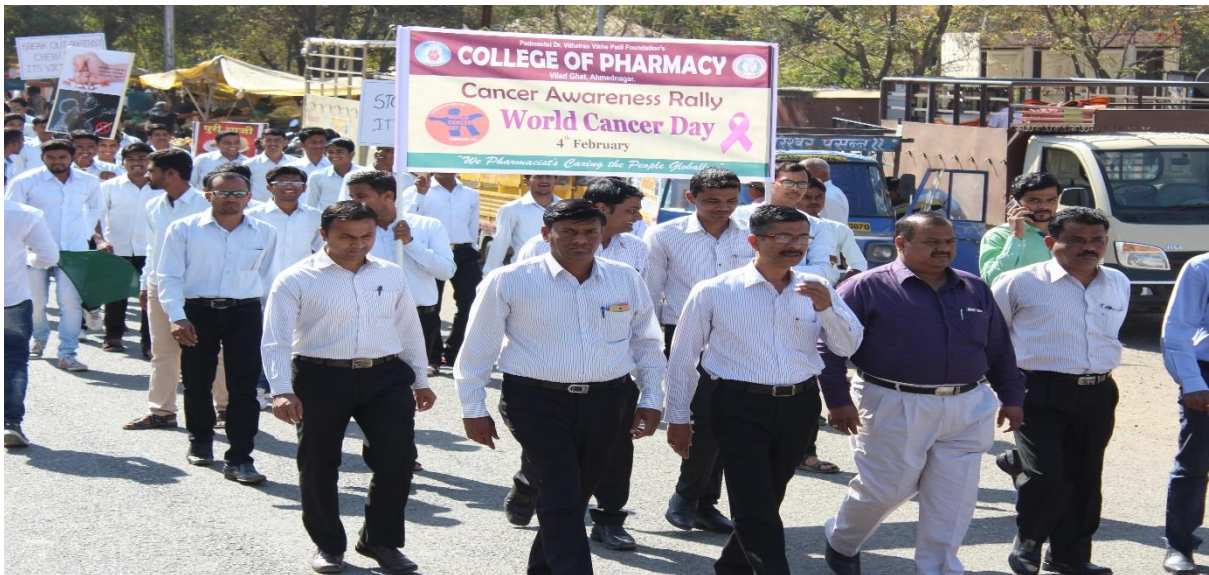
RALLY ON WORLD CANCER DAY : 04/02/2016