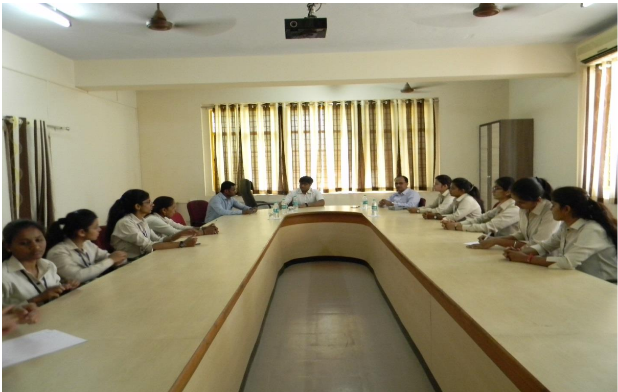
Campus Placement Drive by Apollo Hospital, Mumbai