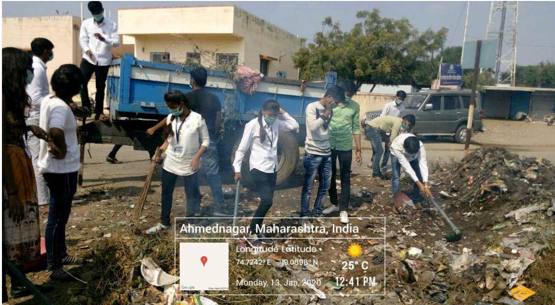
Gram Swachhata Activity at Akolner Village: 13/01/2020