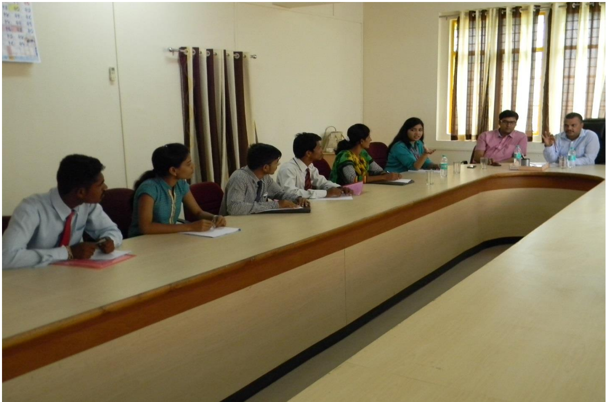
Campus Placement Drive by Glenmark Pharmaceutical Ltd, Aurangabad on 7/06/2016