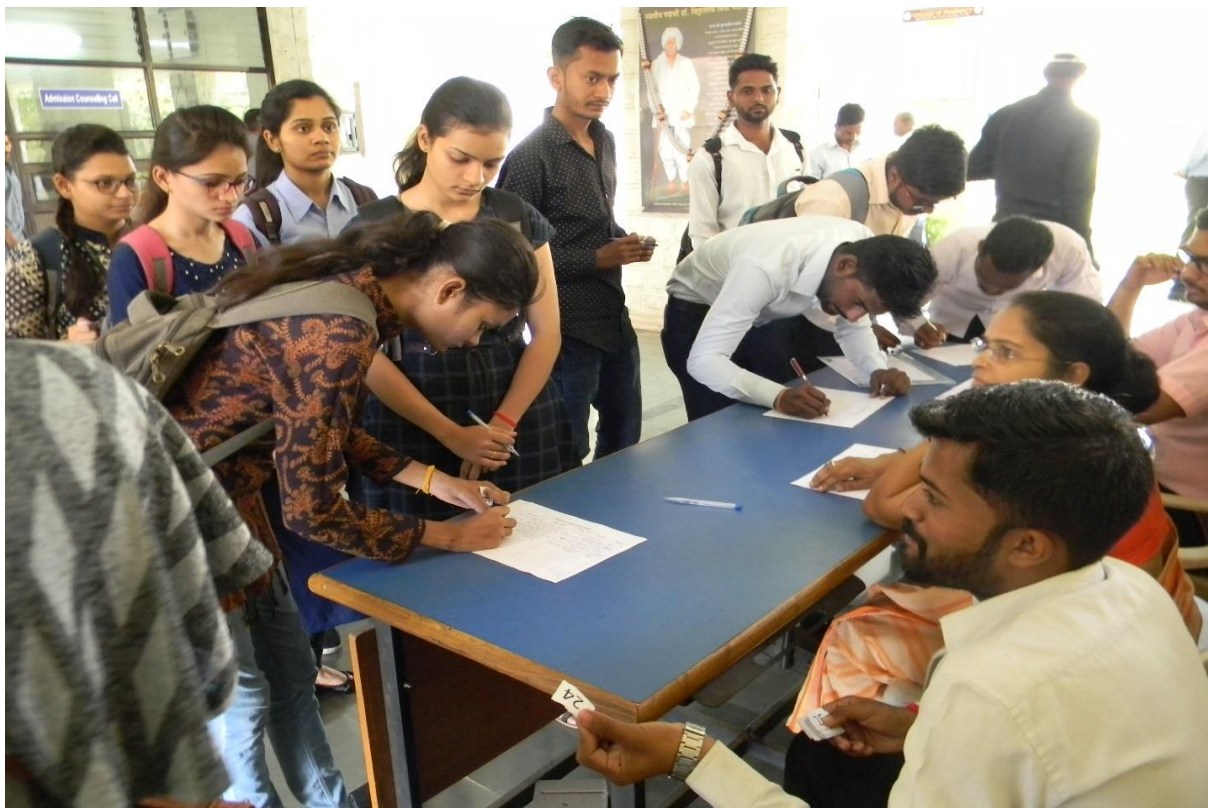
Campus Placement Drive by Sci-Edge Abstract, Pune on 13/06/2019