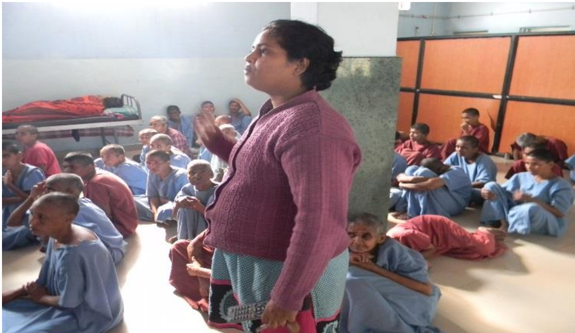
Helping Hands To Mentally Retarded Peoples By Providing Clothes, Grocery At Mauli Seva Sanstha : 12/01/2018