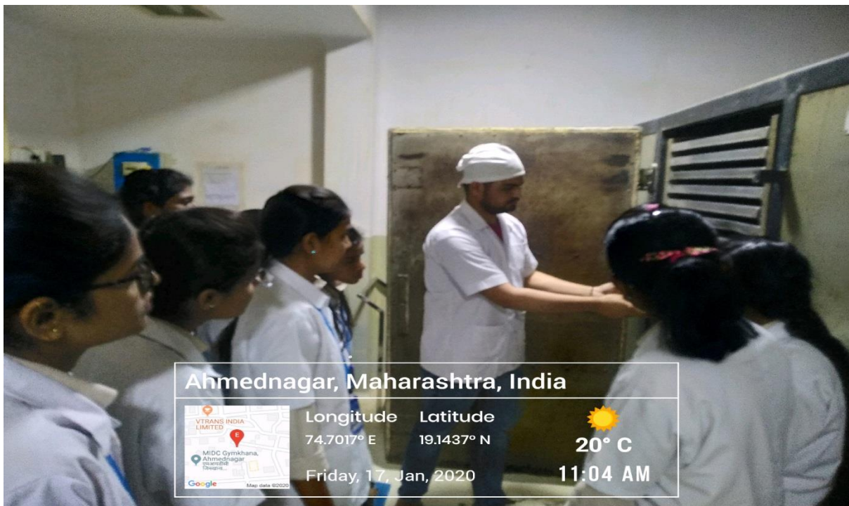
Industrial Visti to Bora Pharma Pvt. Ltd: 17 January 2020