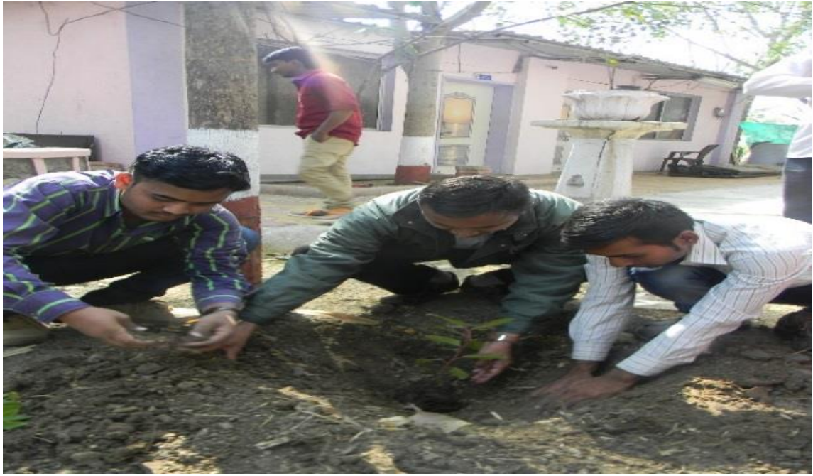
Tree Plantation Activity: 13/01/2018