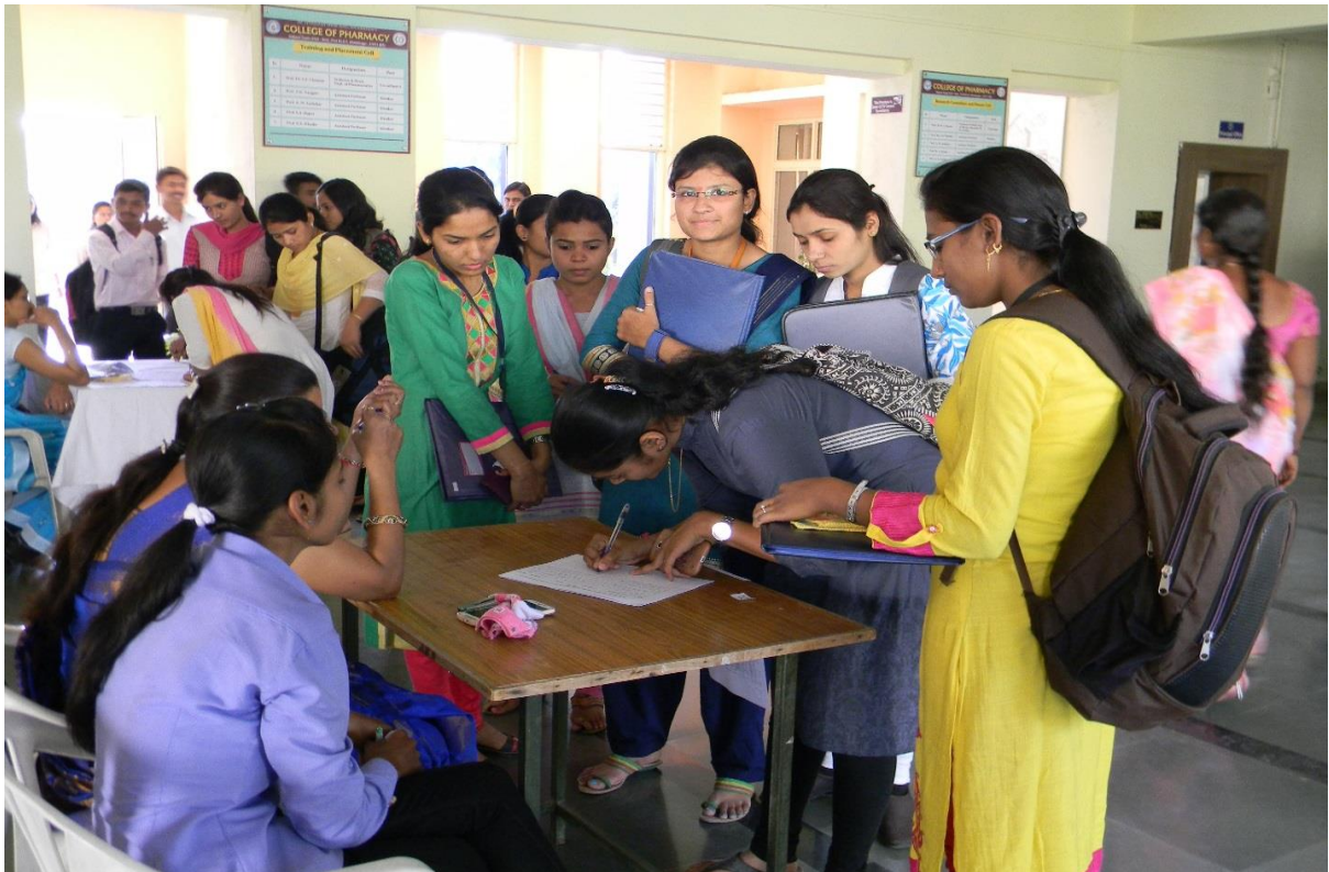
Campus Placement Drive by Sci-Edge Abstract, Pune on 01/03/2017