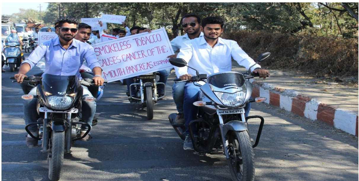
CANCER AWARENESS ACTIVITY : ANTITOBACCO CAMPAIGN : BIKE RALLY : 29/01/2016