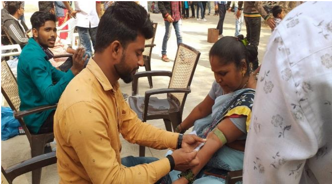
MEDICAL CAMP ON CBC , THYROID ESTIMATION & CANCER TUMOR MARKER TEST : 10/01/2020