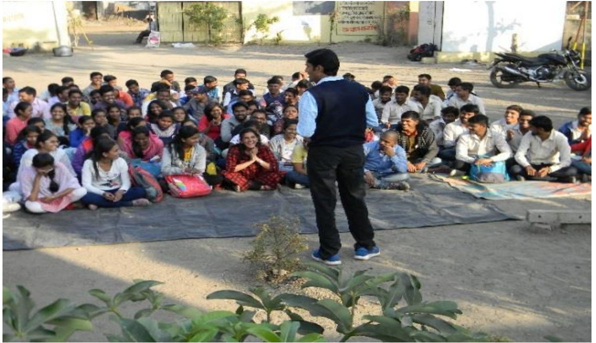
Lecture on Personality Development: 11/01/2019