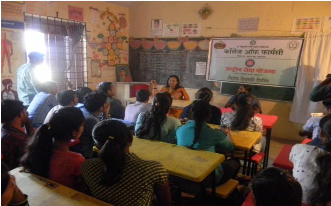
Lecture on Swachha Bharat Abhiyan : 20/01/2017