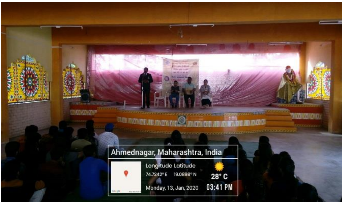
Lecture on Indian LOC & Indian Army: 13/01/2020