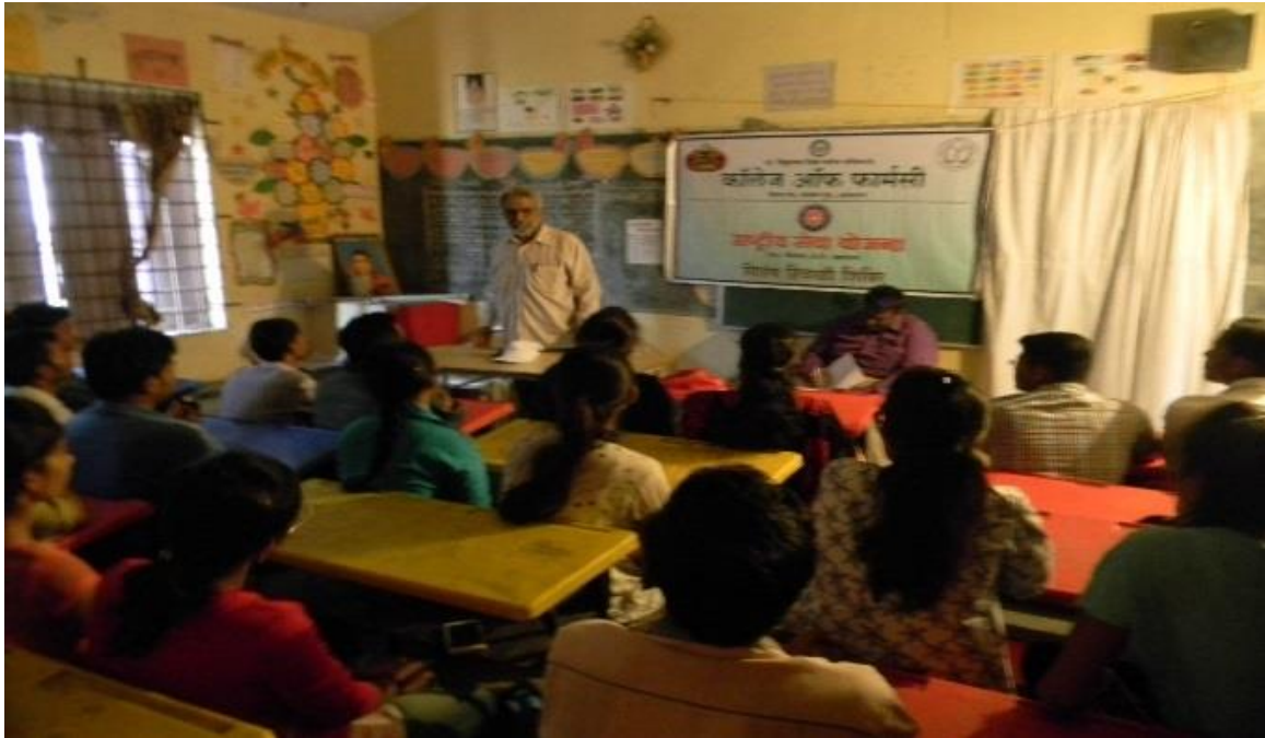
Lecture on Beti Bachao Beti Padhao Abhiyan : 20/01/2017