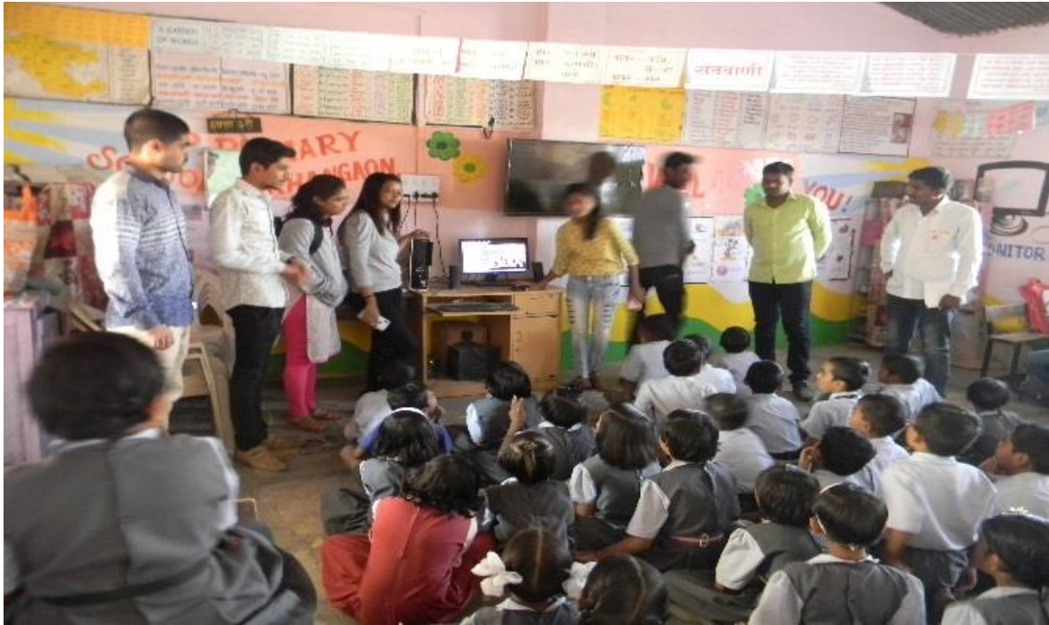
Computer Teaching to ZP School Students: 9/01/2018