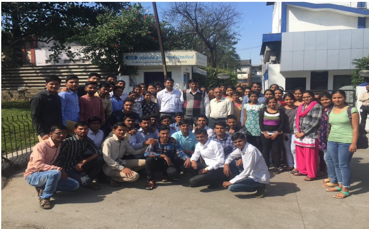
Industrial Visti to Ajanta Pharma Ltd: 20 November 2016