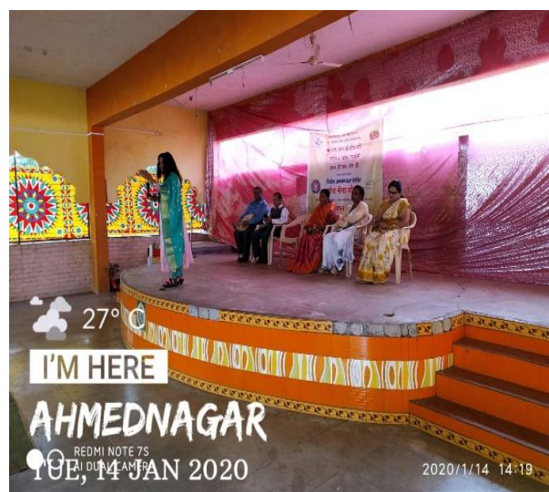
Lecture on Health Awareness: 14/01/2020