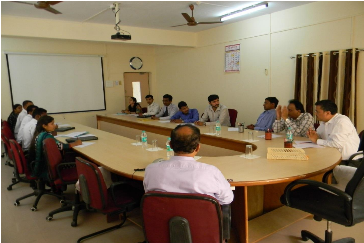
Campus Placement Drive by Glenmark Pharmaceutical Ltd, Aurangabad on 5/11/2016