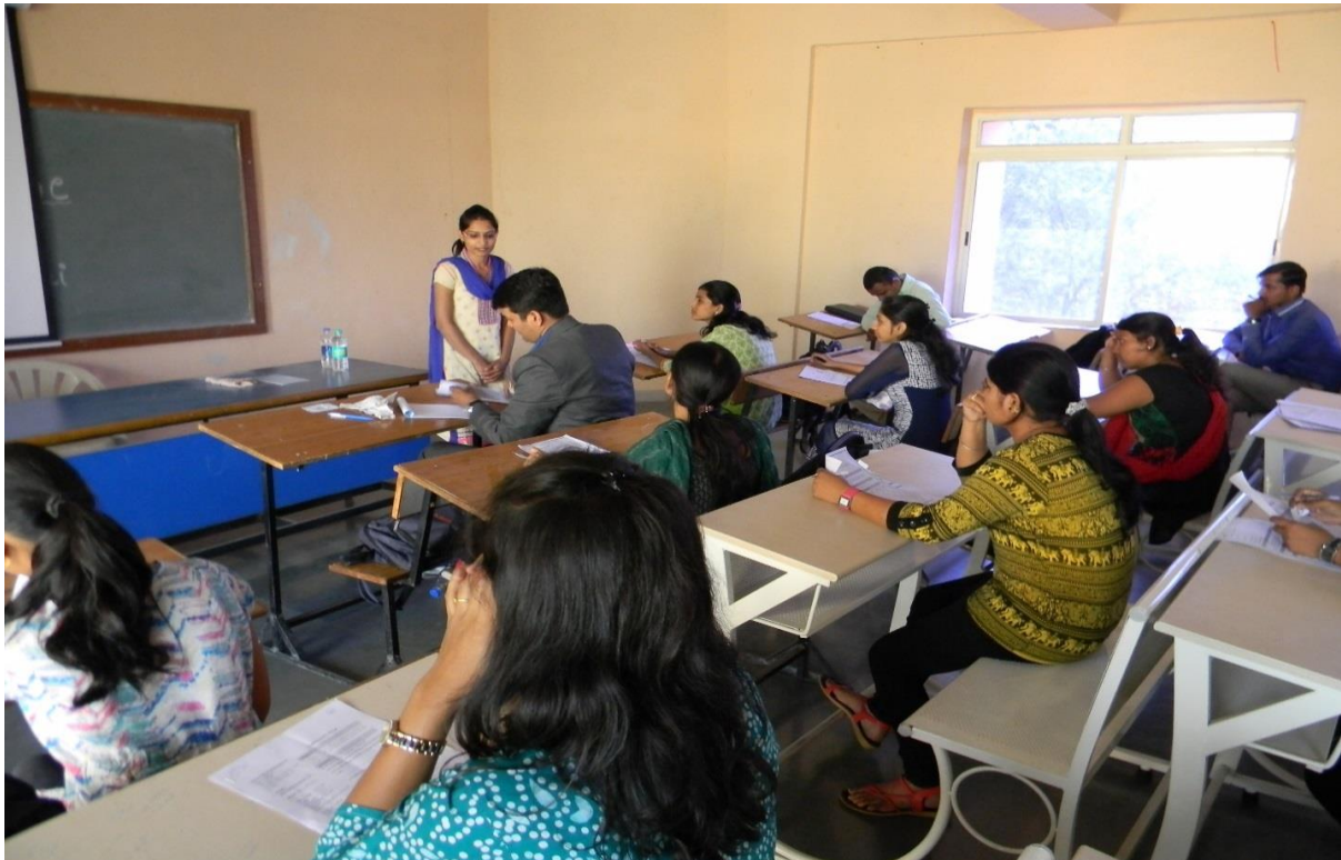
Campus Placement Drive by Tata Consultancy Services (TCS), Mumbai on 9/03/2016