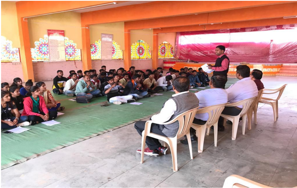
Rally & Lecture on Avayav Daan & Netradan Abhiyan : 11/01/2020