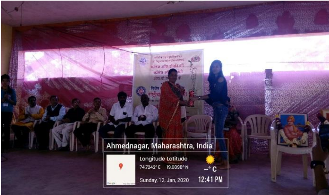
Lecture on Swami Vivekanand Jayanti & Personality Development at Akolner: 12/01/2020