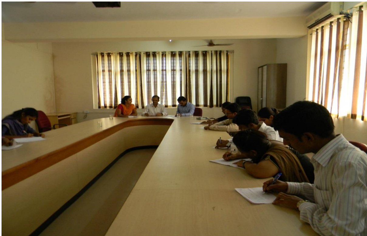
Campus Placement Drive by Sci-Edge Abstract, Pune on 27/09/2016