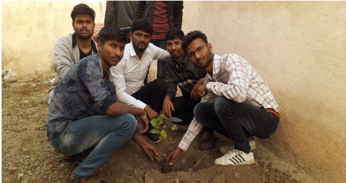
Tree Plantation Activity: 12/01/20 Energy Audit of Akolner Village: 11/01/2020