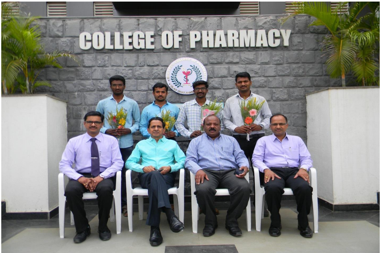
Campus Placement Drive by Omniactive Health Technology Ltd, Supa on 21/06/2017