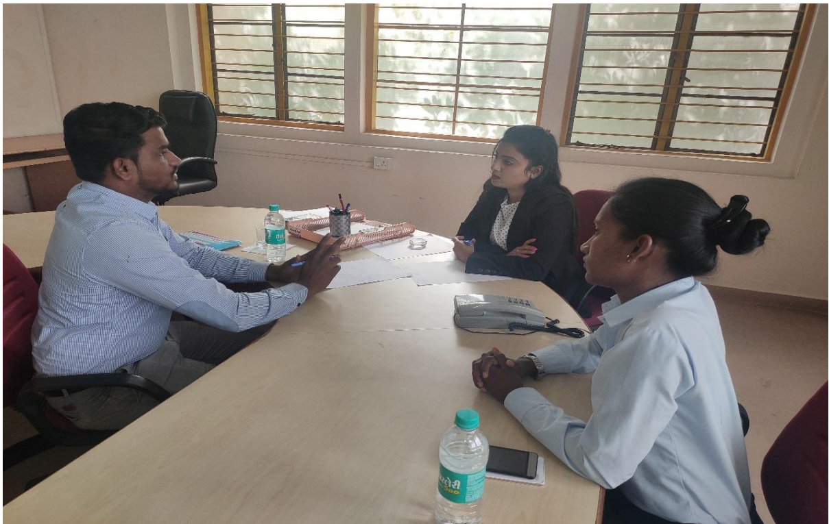
Campus Placement Drive by Man United, Pune