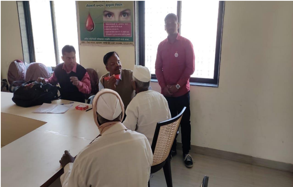
Medical Camp on Free Eye checkup & Cataract Operations: 10/01/2020