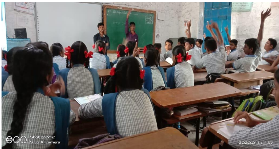
Computer Teaching to ZP School students at Akolner Village: 12/01/2020