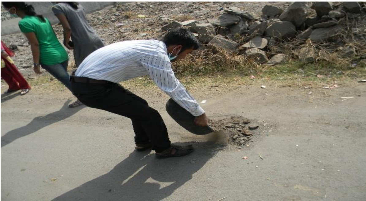
Road Patching & Maintenance Activity: 18/01/2017